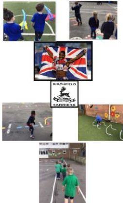
We have been learning about Olympic gold medallist Dame Denise Lewis. We competed in some heptathlon events.

It has been amazing to see the wonderful learning that FS have been engaged in, learning about Olympic gold medallist, Dame Denise Lewis.